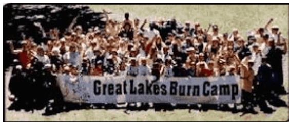
Benefit4Kids.org is helping children obtain lifelong dreams and goals.